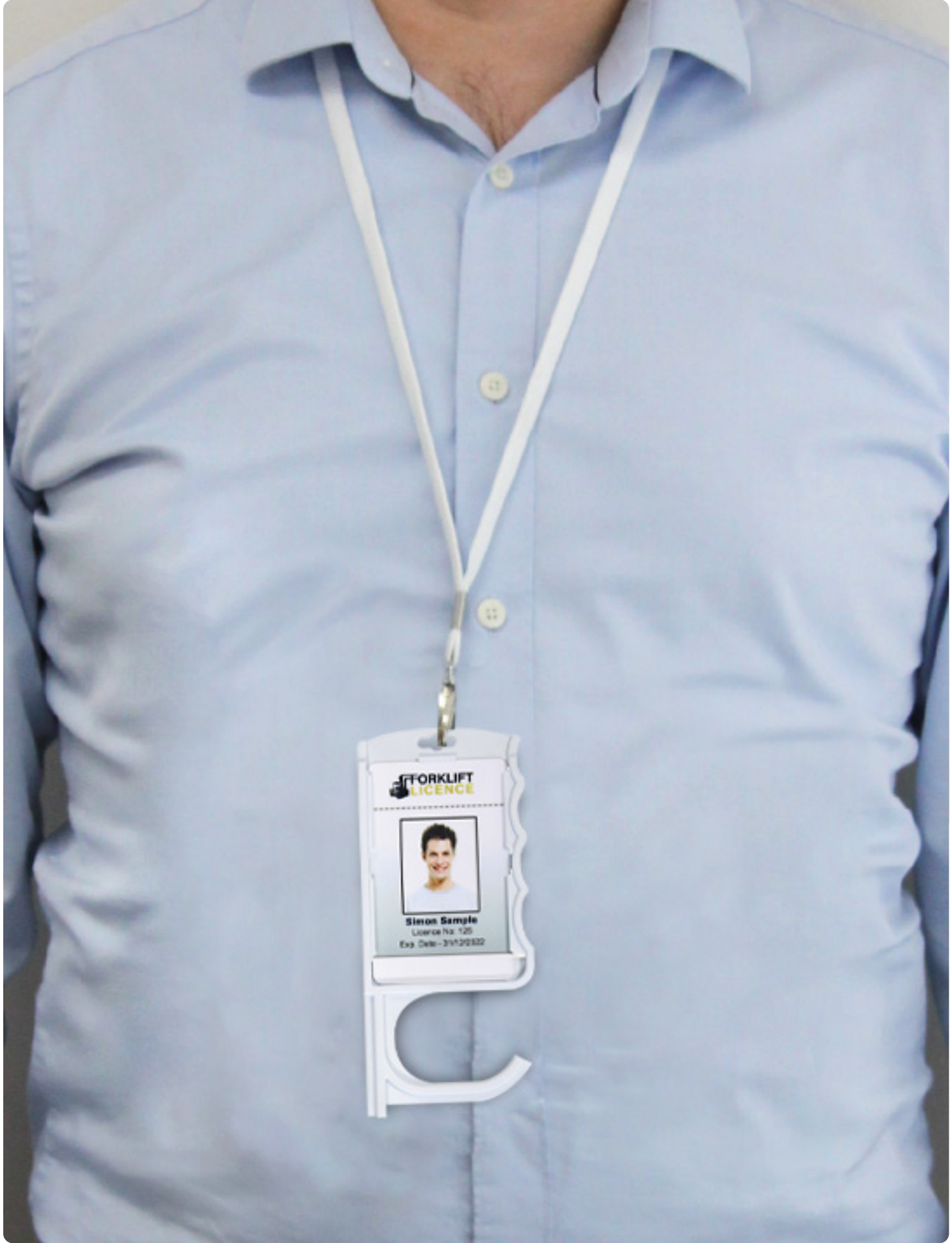
Lanyard just for illustration purposes. Sold separately